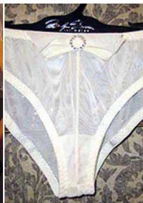
Marilyn Monroe Intimates