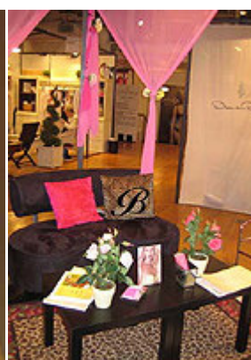
Betsey Johnson Intimates

Animal prints will never go out of fashion it seems, and are especially popular on swim and nightwear . Classic leopard print clashes with hot fuchsia pink , as seen on this Brigi pyjama above and in a larger scale at the Betsey Johnson Intimates stand.