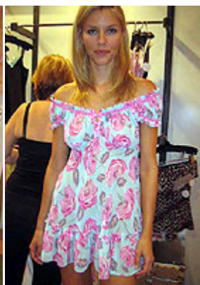
Betsey Johnson Intimates