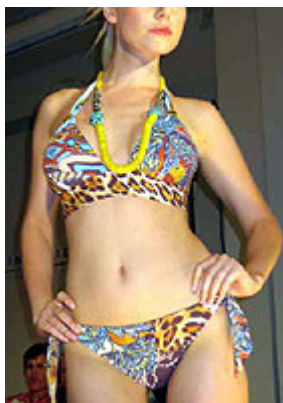
Malizia by La Perla