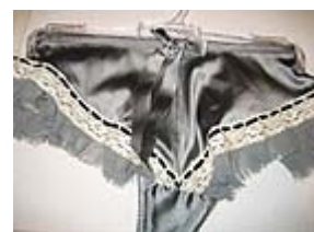
Elle Macpherson's pretty slate grey silk panties