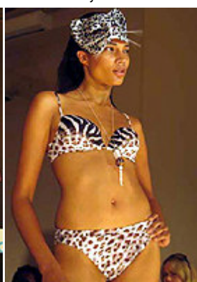
Malizia by La Perla