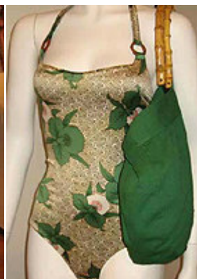
Malizia by La Perla