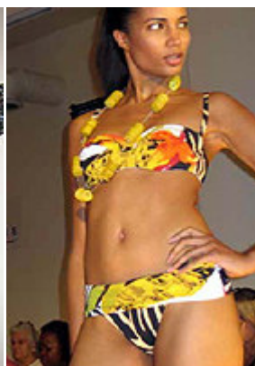
Malizia by La Perla