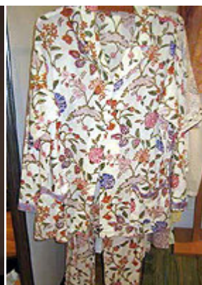
CLM Cotton & More