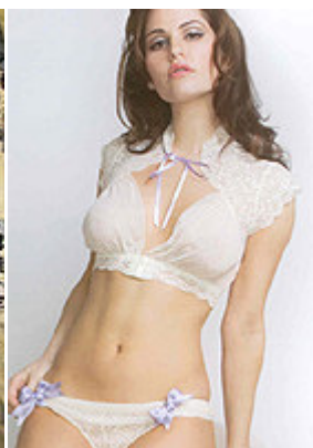
Lisa's Folly by NK Attitude