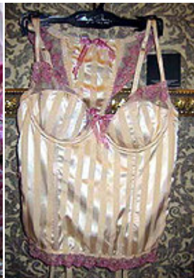
Marilyn Monroe Intimates