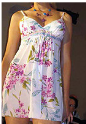
Oscar de la Renta Lingerie