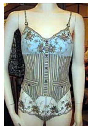
Waistcoat styling by Lejaby