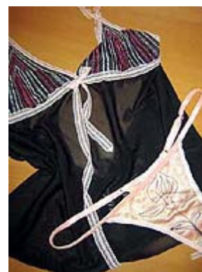
Embroidered thong set by Clo