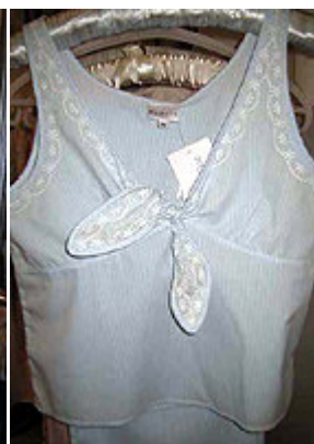
Lavender Blue Interiors