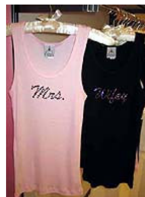
Diamanté logoed wedding vests by Classy Bride

Country florals and English Liberty-style prints have been used as a softer option to oriental florals . Colours include pastel shades and flowers are smaller, less dramatic, look more romantic , and are feminine and soft against pale skin tones . Rosapois has designed a pink and blue, girl-next-door , tulle bra set and for a typical English rose , Betsey Johnson has flouncy off-the-shoulder nightdress .